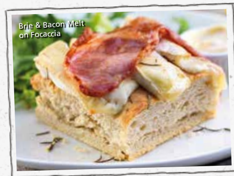
Brie & Bacon Melt on Focaccia