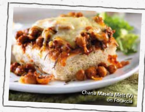
Chana Masala Melt (V) on Focaccia

A delicious range of sandwiches freshly prepared to order. If you prefer a different bread to what we've suggested just ask & you can have it your way. We have Genius™ bread too. All our sandwiches & focaccias come served with either a dressed salad garnish or skin-on fries, the choice is yours!